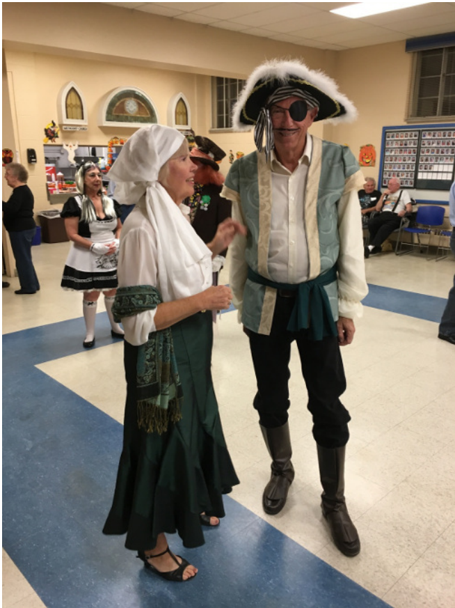
Everyone's Polish on Dyngus Day